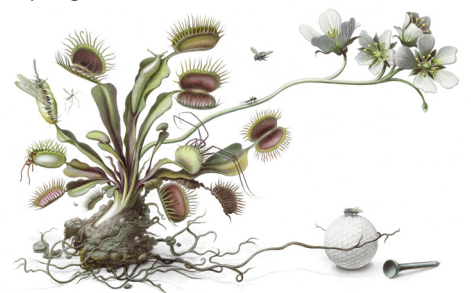
ILLUSTRATION BY ARMANDO VEVE