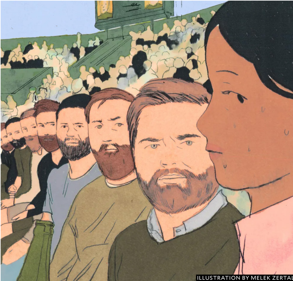
ILLUSTRATION BY MELEK ZERTAL