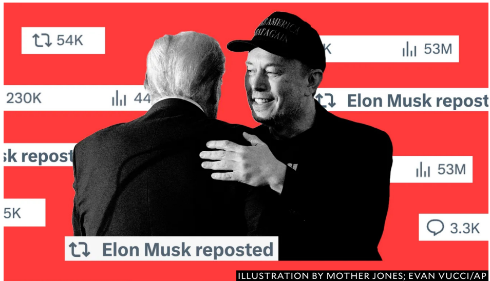
ILLUSTRATION BY MOTHER JONES