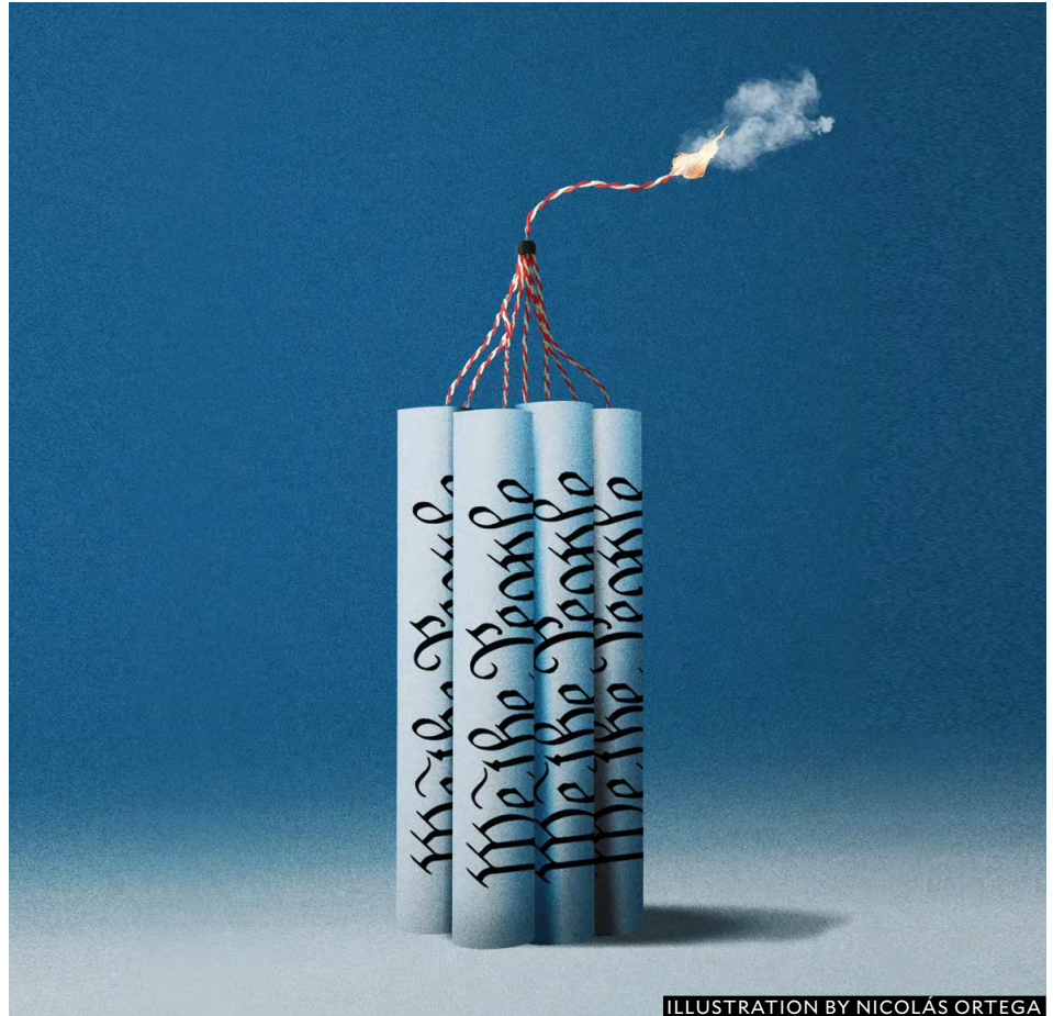
ILLUSTRATION BY NICOLÁS ORTEGA