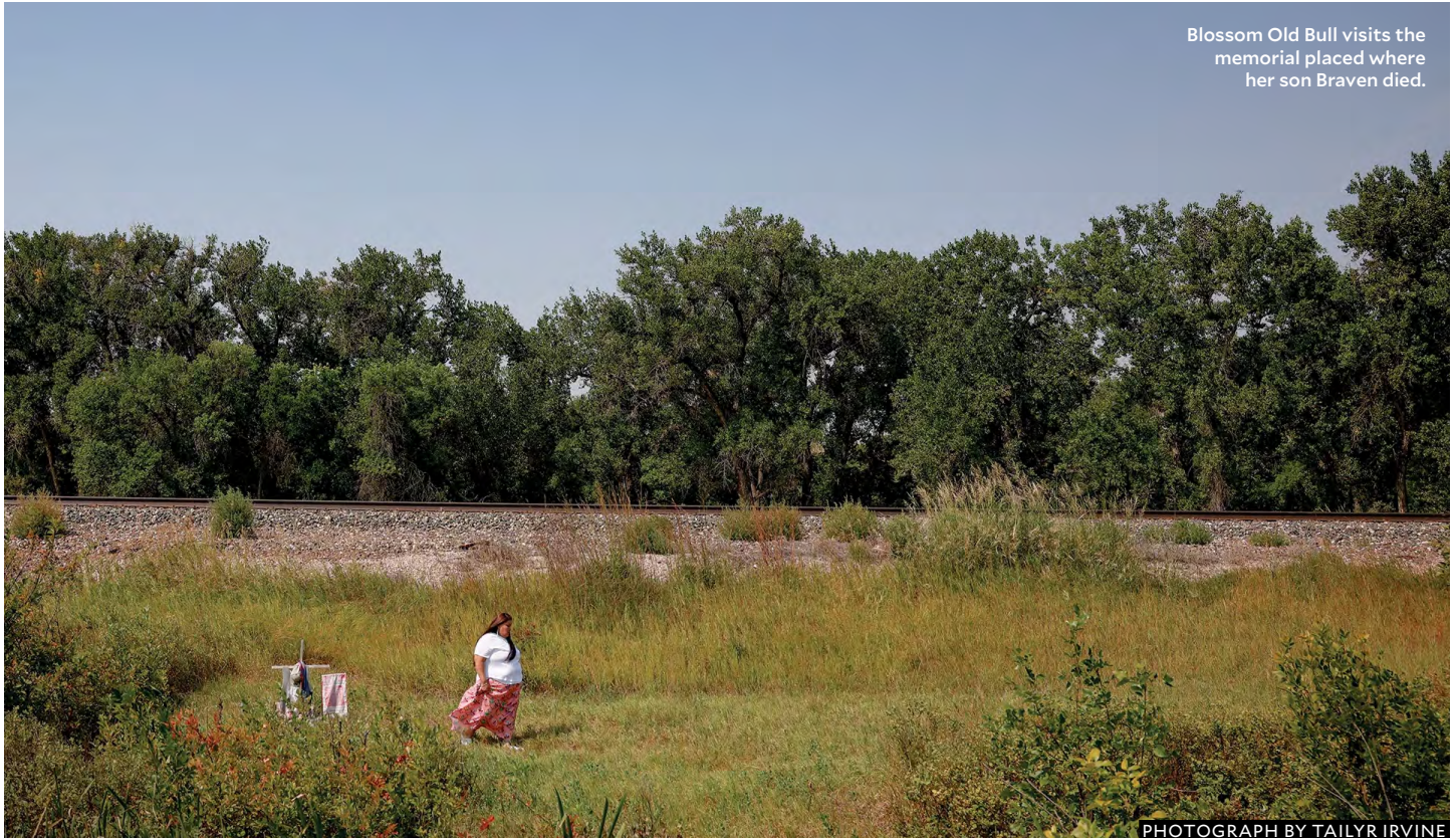
Blossom Old Bull visits the memorial placed where her son Braven died.